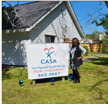
CASA of West CenLA