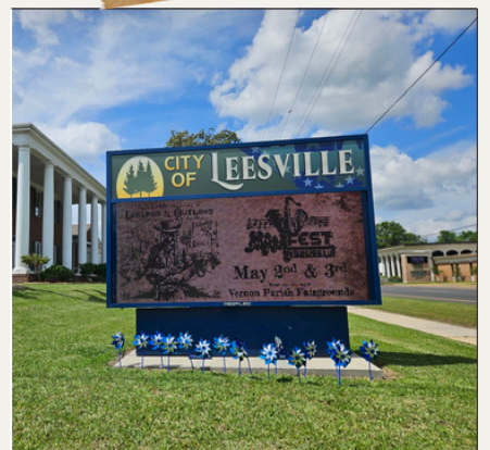
Leesville City Hall