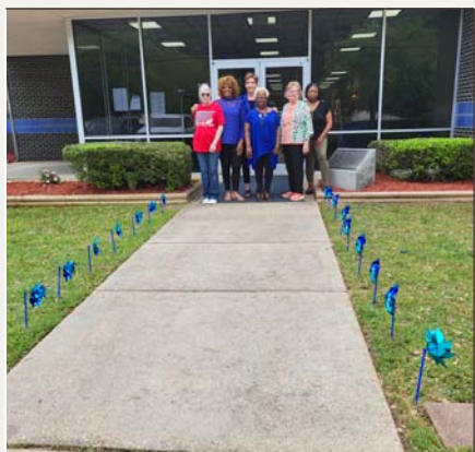
Vernon Parish School Board