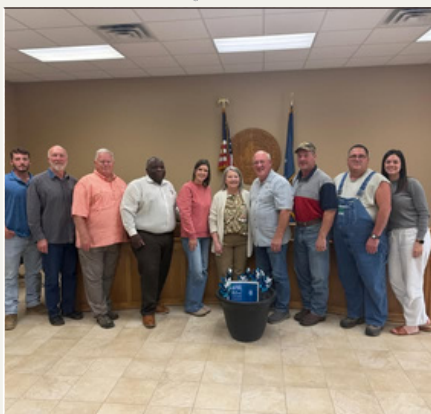
Hornbeck City Hall