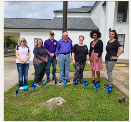
Vernon Police Jury