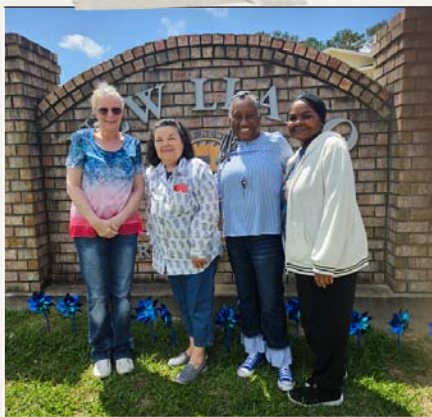
New Llano City Hall