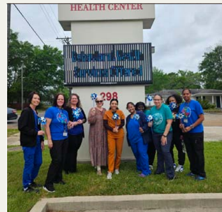
Vernon Community Health Center