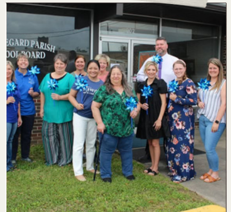
Beauregard Parish School Board