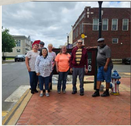
Vernon Council on Aging