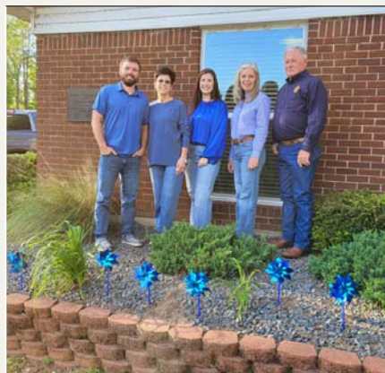
Simpson Town Hall