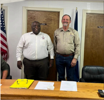
Anacoco City Hall