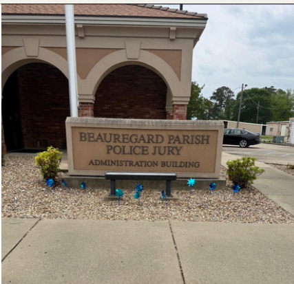
Beauregard Parish Police Jury