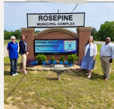
Rosepine City Hall