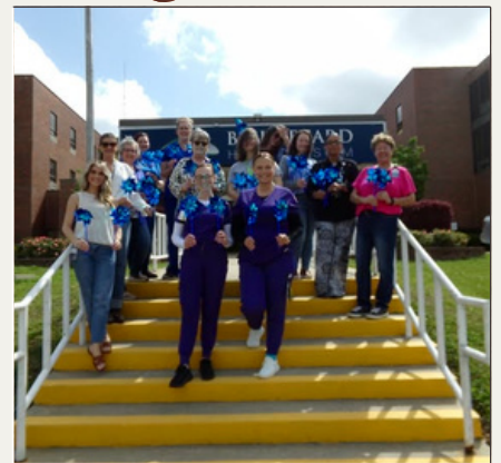
Beauregard Health Systems