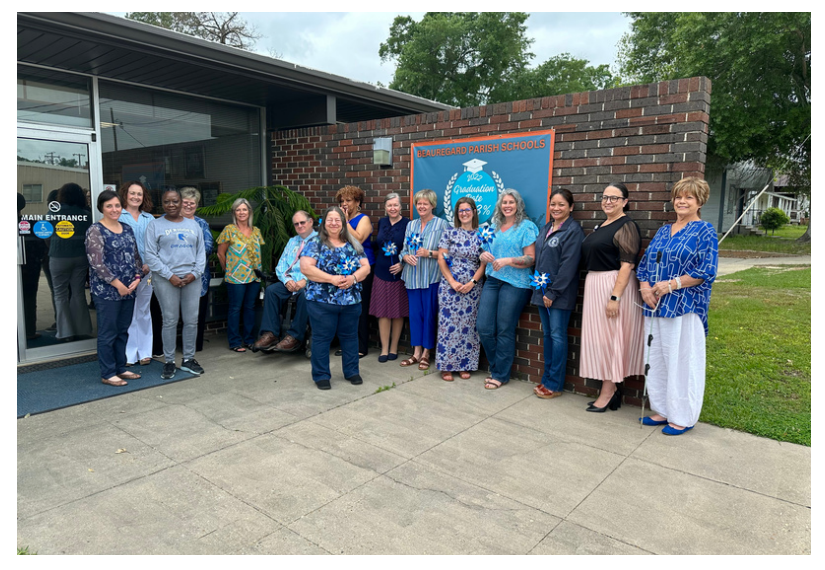
Foster Parent Appreciation Month