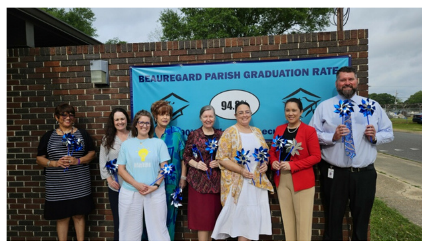
CASA Color Run