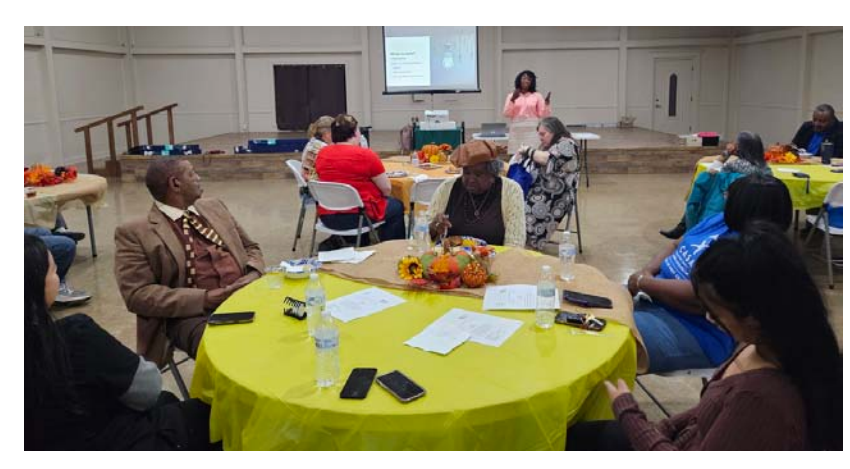
Child Abuse Prevention Month